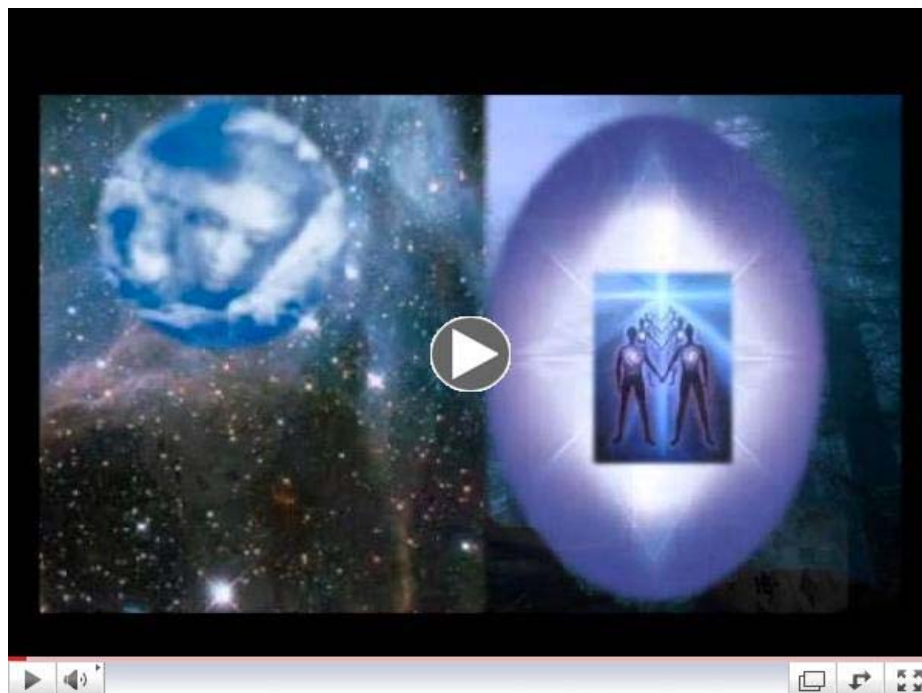
Living In 2 Worlds

At last, we find ourselves at the threshold to New Earth. However, we are quite exhausted from our long journey through the fourth dimensions. Hence, we rest just a moment when we hear the voice of Arcturians: